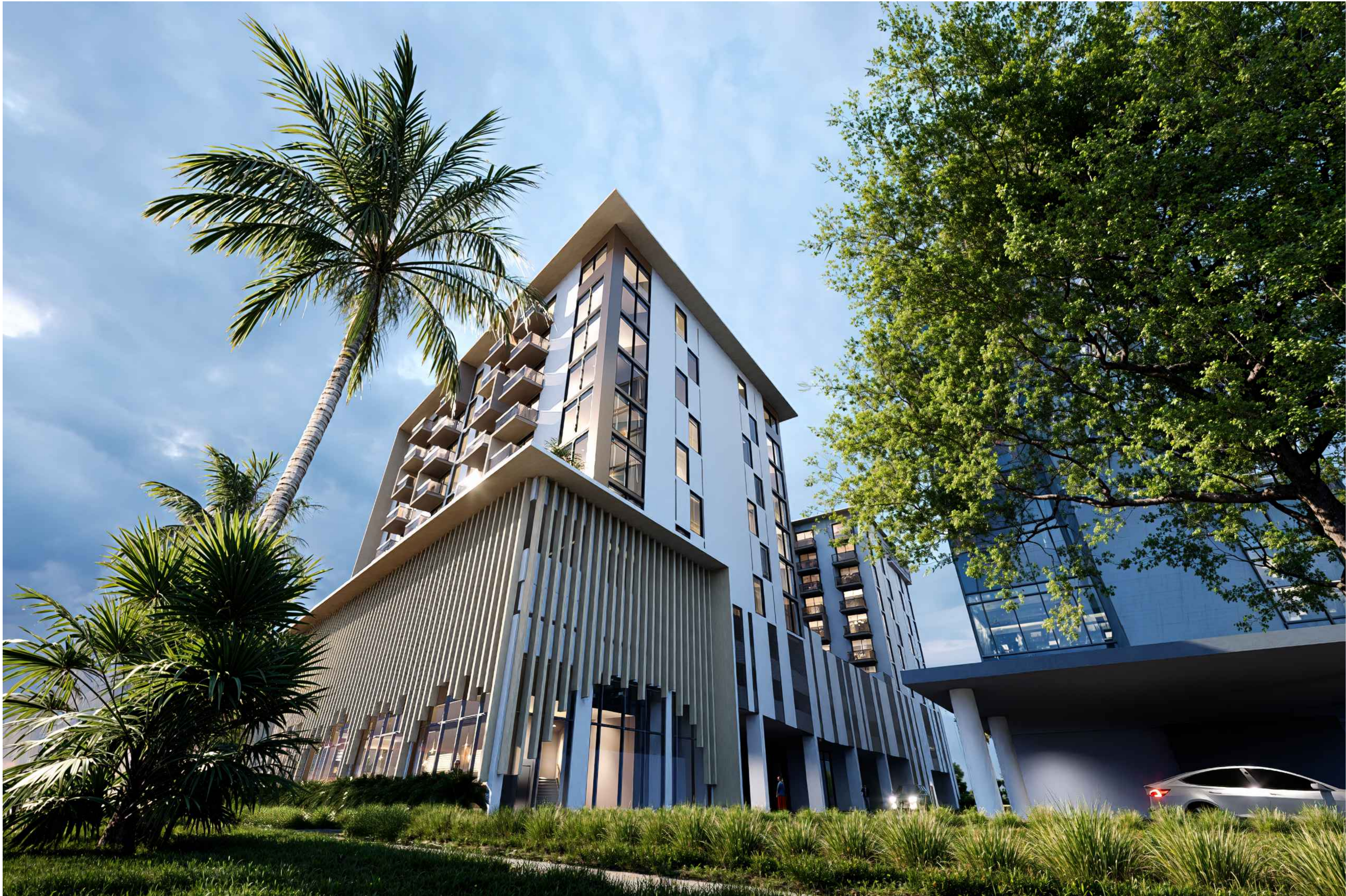
STREET VIEW OF THE SOUTH WEST CORNER OF THE BUILDING